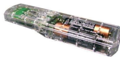
FSRK-2.4G-1 as a Remote Control